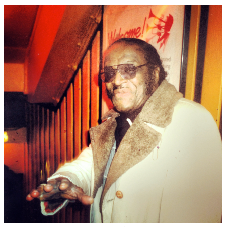
Hey, Hey, You're the Next in Line!

If you need a scan of the track, happy to send on if its not included below, or a reference MP3 of any track so you can hear it, or just drop me a line.