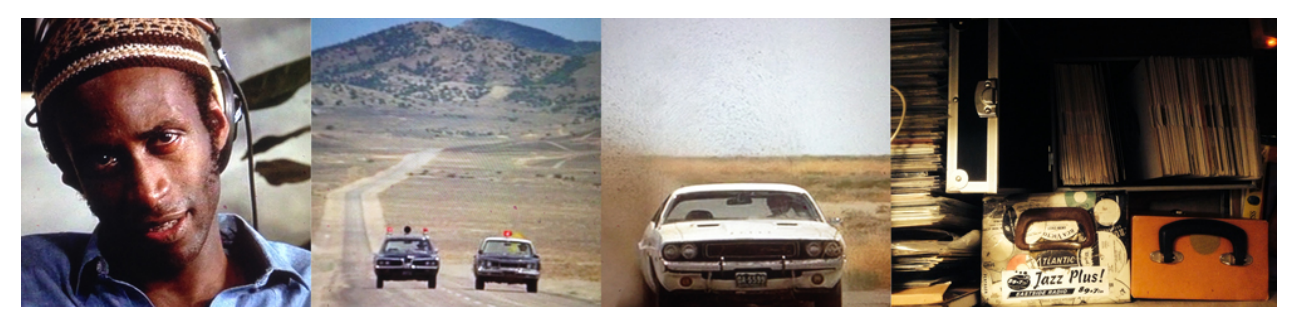
For all you Super Soul Challenger's, get through em Baby, Get through em!

Don't Use Mint much, as there are not many out there that actually are, but, EX++ is next to mint as it can be for a sixties record in my book, and decreases EX+,VG++, VG+ VG I'm straight on grades, and if I've missed anything happy to refund ©